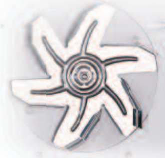
Two speed fan for matching the airflow to your application