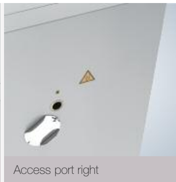
Access port right