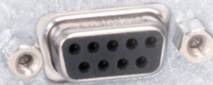
RS232 standard on all GP, AP, and APS models/sizes

Heratherm incubators offer superior data monitoring systems that provide the key to reliable results.