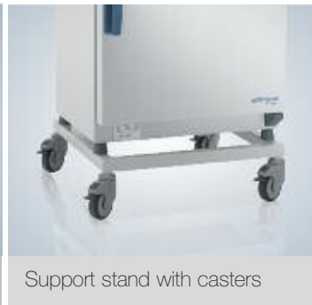
Support stand with casters