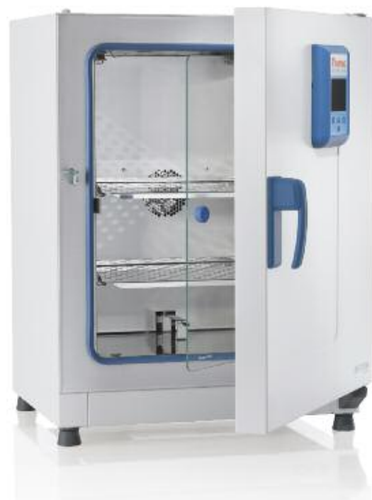
Thermo Scientific Heratherm Advanced Protocol microbiological incubator with unique dual convection

Exceptional temperature performance for demanding applications.