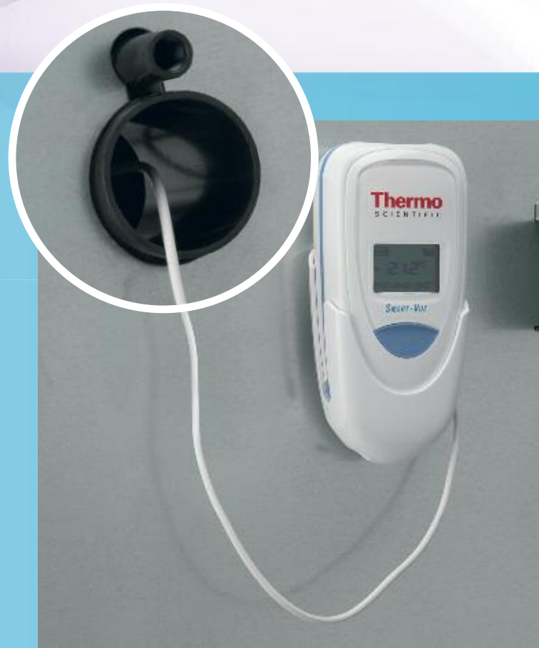
Rear view of the 100 L Advanced Protocol oven with Smart-Vue

Solutions vary by RF regions worldwide and are compatible with multiple brands and types of laboratory equipment. Contact your local sales representative for more details.