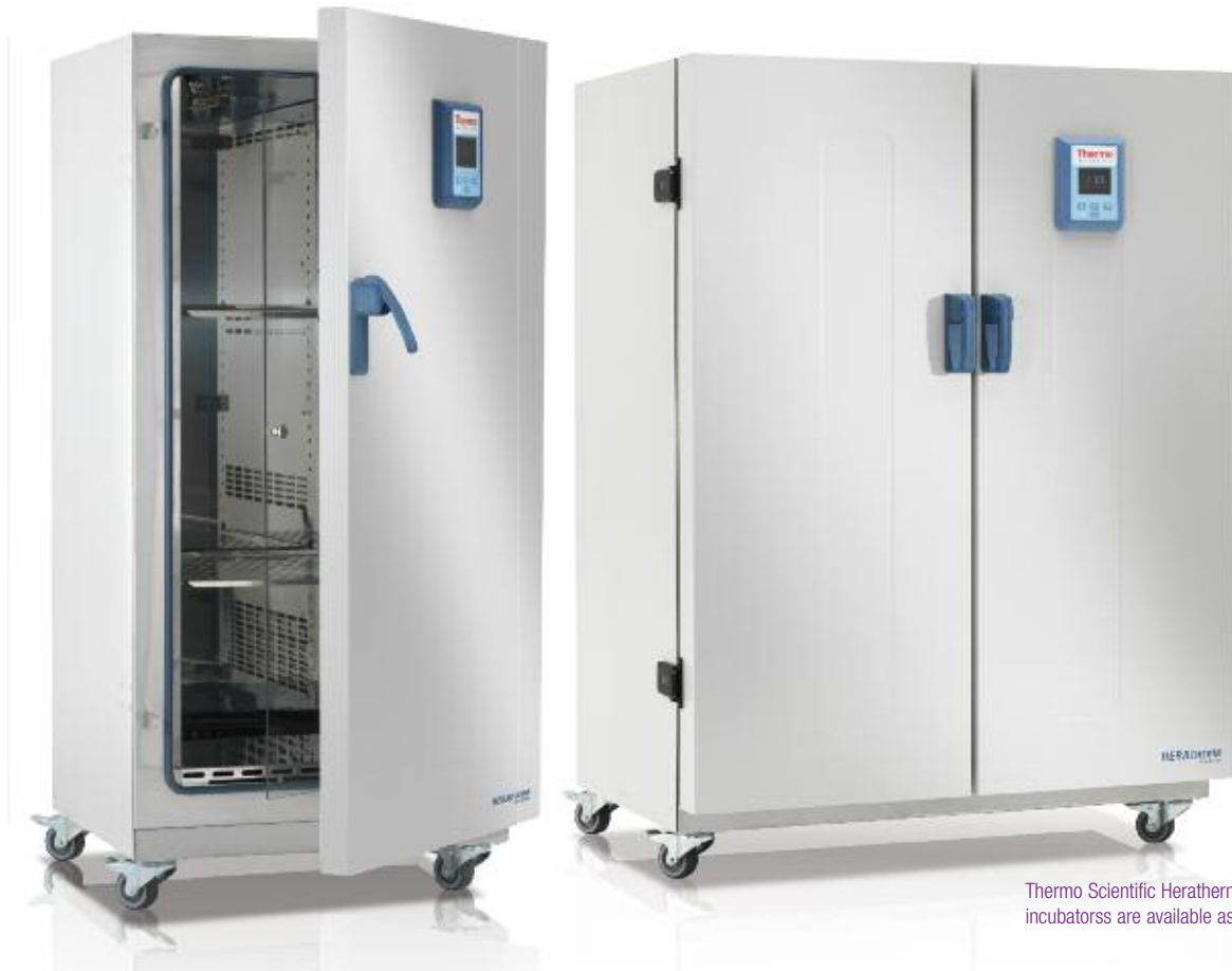
Thermo Scientific Heratherm large capacity incubators are available as 400 L and 750 L units.

Designed with your need for high sample volume or larger samples in mind.