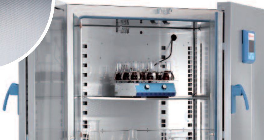
Access port for independent sensor or use of shaker / stirrer inside the unit