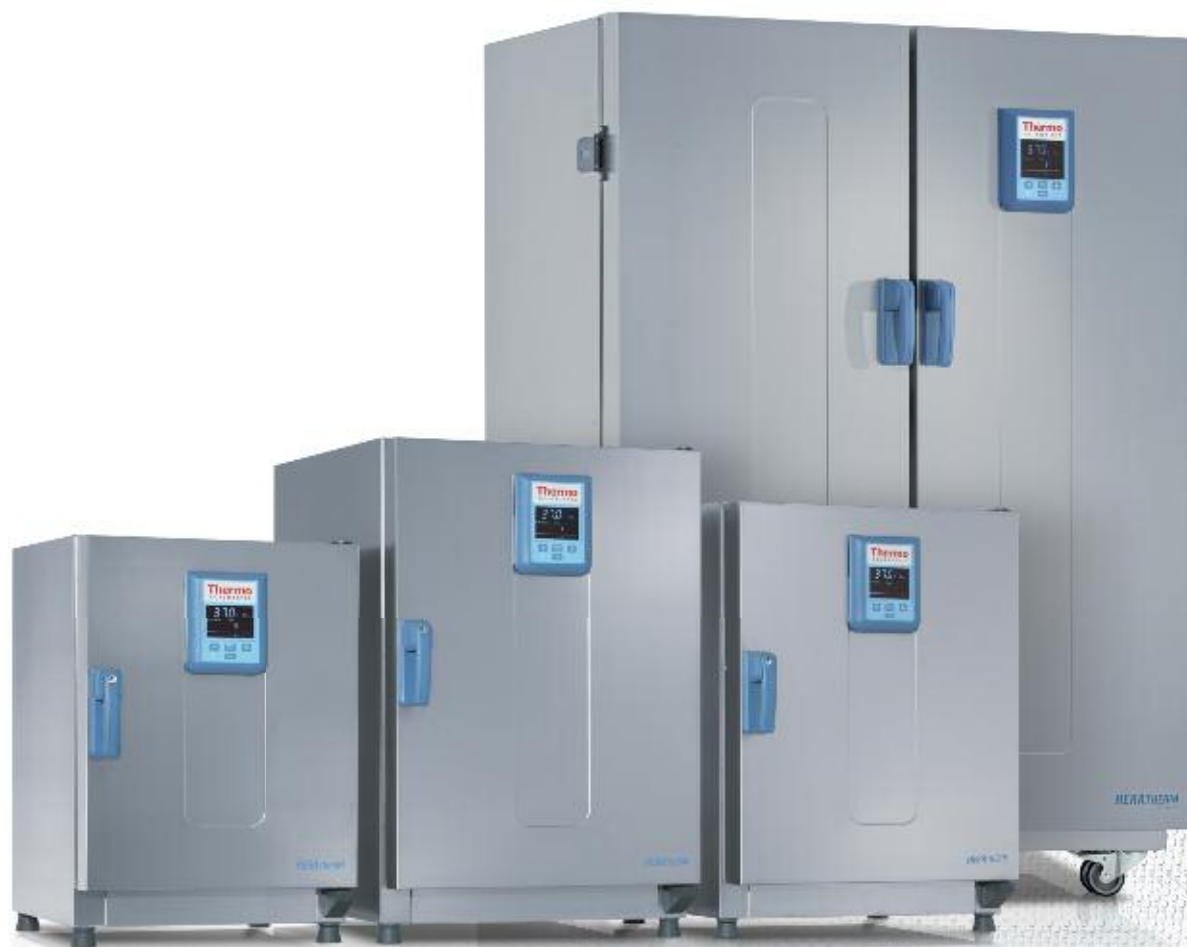
Heratherm Advanced Protocol Security microbiological incubators with stainless steel exterior

An optional stainless steel exterior is available for the Advanced Protocol and Advanced Protocol Security models.