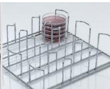
Petri dish holder