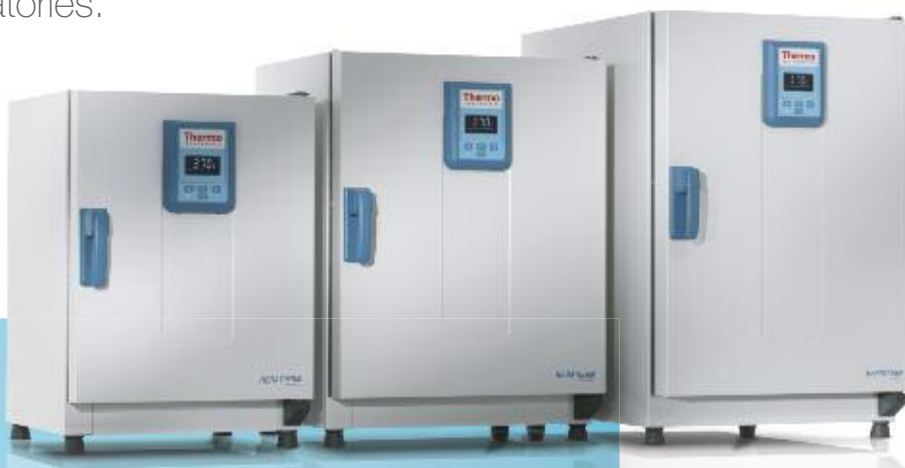
Heratherm General Protocol Ovens, 60 L, 100 L, 180 L models

Designed for routine applications in pharmaceutical, medical, food and research laboratories.