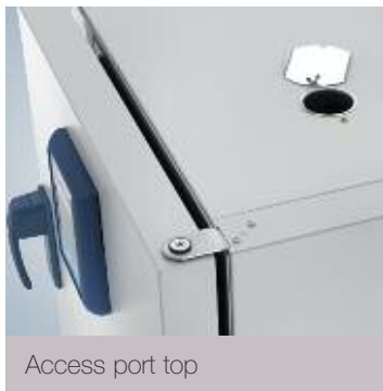
Access port top