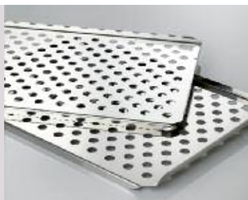
Stainless steel perforated shelves