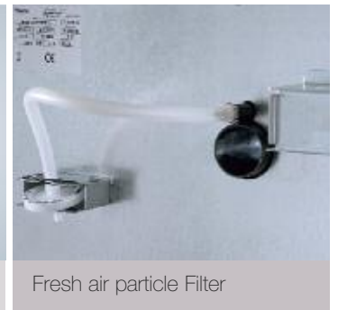
Fresh air particle Filter