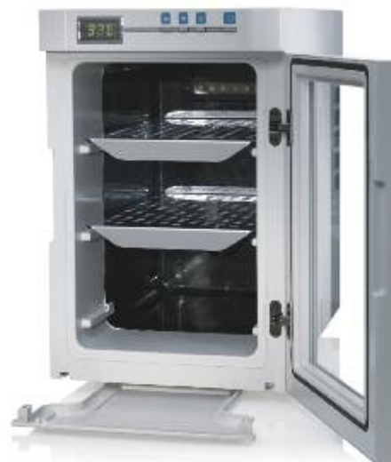
Heratherm Compact microbiological incubator, 18L